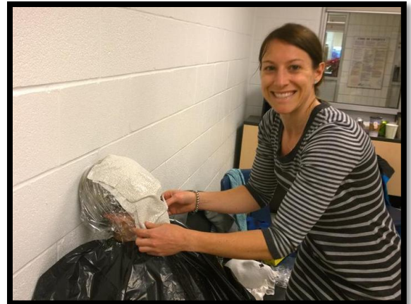
Learning about trust and communication through plaster masks.

The goal of this initiative for PVNCCDSB is to train teachers to lead the program in their own classes and to bring greater awareness to their whole school. This learning will support integrating a First Nation, Métis and Inuit perspective into our teaching across all curricular areas.